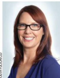
SOUTH FULTON CID

The importance of the issue is evident in two of its current projects: the reconstruction of the intersection at I-85 and Ga. Hwy. 74 and the development of a park-and-ride lot in Fairburn.