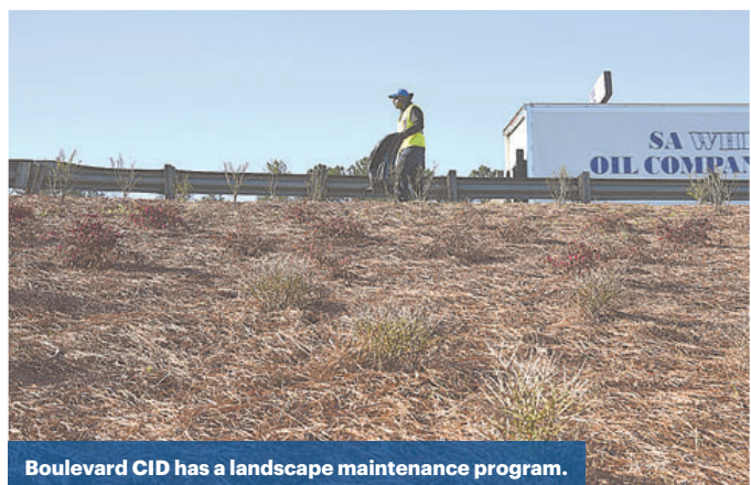
Boulevard CID has a landscape maintenance program.

"We need to make sure the area matches the wonderful airport we have. We have the Disney World of airports, so we want to create the Disney World area of airports," said McDowell , adding that the CID recently launched a transit study to identify new ways to help people with extended layovers venture out into the area using new technologies like autonomous shuttles or an expanded Atlanta SkyTrain .