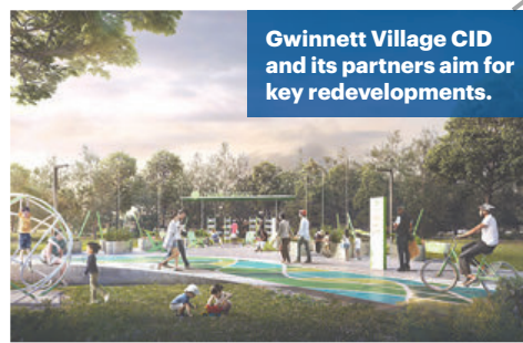
Gwinnett Village CID and its partners aim for key redevelopments.