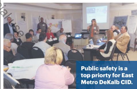
Public safety is a top priority for East Metro DeKalb CID.