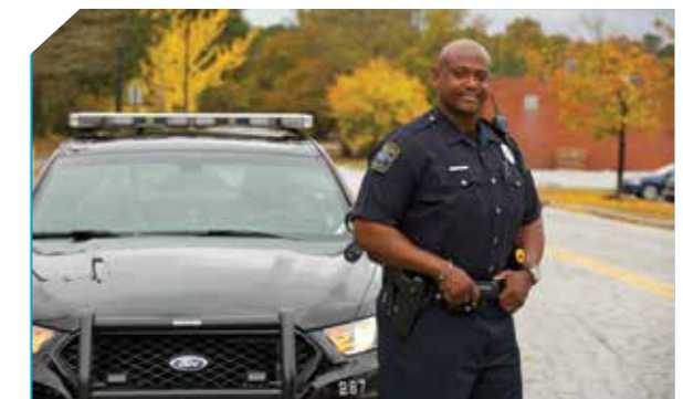
IMPROVED PUBLIC SAFETY IS ONE OBJECTIVE AND A RECENT ACHIEVEMENT BY BCID