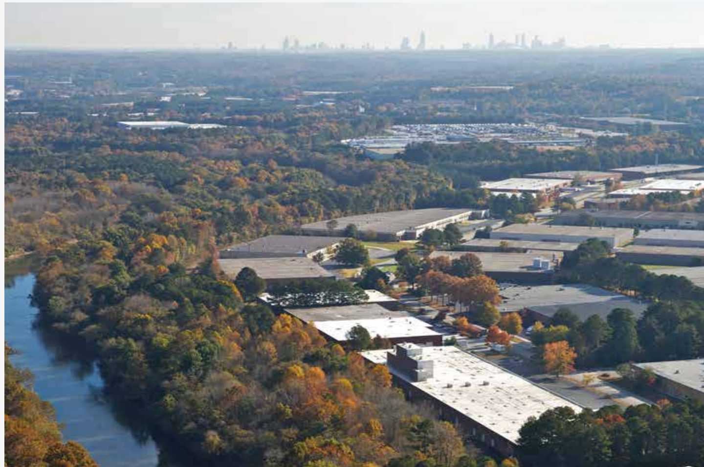
The Fulton Industrial Boulevard area and the Chattahoochee River, with a view to downtown Atlanta.